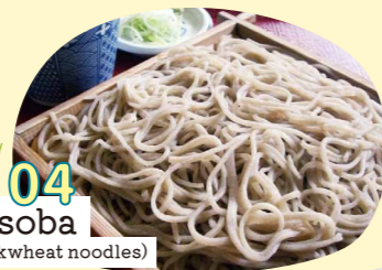
04 Zarusoba (cold buckwheat noodles) It has a smooth texture