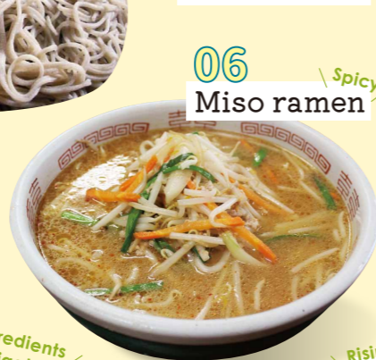
06 Miso ramen Spicy