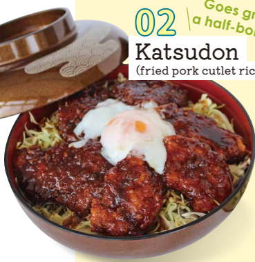
02 Katsudon (fried pork cutlet rice bowl) Goes great with a half-boiled egg!