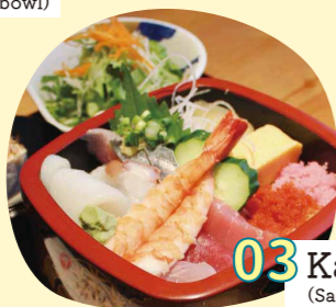
03 Kaisen-don (Sashimi rice bowl) Fresh ingredients from Niigata