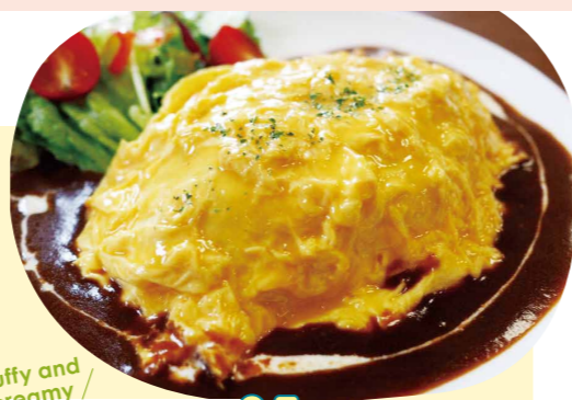
05 a rice omlet puffy and creamy