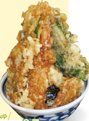
07 Tendon (tempura bowl) Rising up