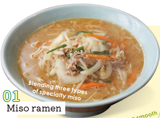
01 Miso ramen Blending three types of specialty miso

We'll show you a couple of dishes cooked with local ingredients grown on fertile soil with clean water.